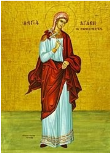
Martyr Agathe of Sicily (+251)

Holy Trinity Greek Orthodox Cathedral 1973 E. Maryland Avenue Phoenix, Arizona 85016 602.264.7863